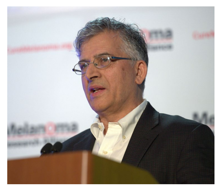
Vijay Kuchroo, PhD — Harvard University

In mouse models, blocking PSGL-1 with antibodies enhanced antitumor immunity, even in tumors resistant to anti-PD-1 therapy (checkpoint blockade). "We found that we also could see significant [tumor] control." This correlated with increased T-cell infiltration into tumors. The researchers are now developing human anti-PSGL-1 antibodies with the goal of testing them in combination with existing immunotherapies like anti-PD-1 in patients with melanoma. Preliminary data suggest that these antibodies can reinvigorate exhausted human T cells. "We are now ready to study the impact of our antibodies [on patient T cells]. We are looking for the capacity