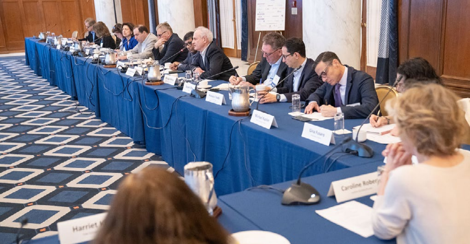
Researchers, clinicians, and government officials from FDA and NCI meet for the Industry Roundtable discussion.